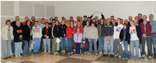
2009 Service Day Volunteers

The Outreach Ministry Team is bringing this theme to the area around our church again this year with our Second Annual Fall Service Day on Saturday, October 30 th . We will be reaching out to our neighboring homeowners with God's love by helping them with small repair and maintenance tasks that they may not be able to do themselves. These jobs may be indoors or outdoors, ranging from cleaning and painting to raking leaves and clearing garden beds.